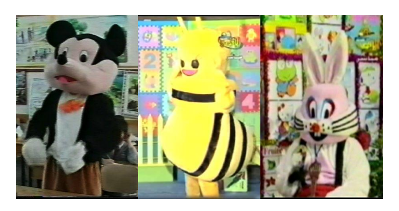
Using charming children's characters to teach hate and violence

Farfur (Mickey Mouse) was beaten to death by an Israeli policeman Nahul the Bee died when the Israeli "siege" of Gaza prevented him from reaching a hospital Now there's a new character for Tomorrow's Pioneers , Assud the Rabbit