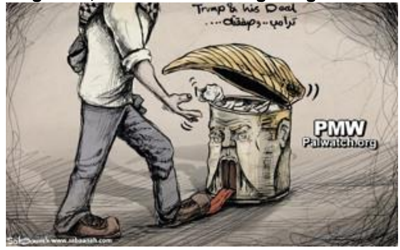
[Official PA daily Al-Hayat Al-Jadida, Dec. 13, 2017]

Trump's head = Garbage can Trump's tongue = Foot pedal Trump's hair = Garbage Cover The garbage itself = Trump's "Deal"