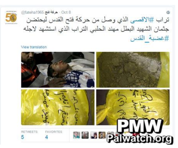
Soil in yellow bags at murderer's grave