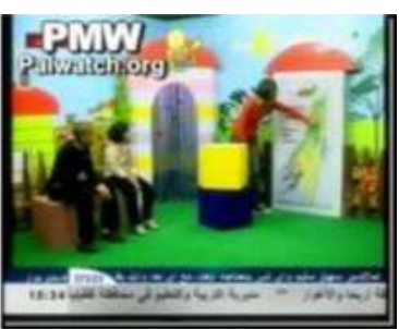
[PA TV (Fatah), July 27, 28, 29, August 1, 2, 3, 4, 8, 9, 10 2010 twice daily]