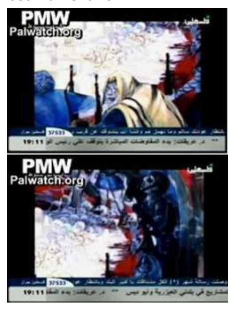
[PA TV (Fatah), July 28, 2010]

A painting of Jews wearing prayer shawls and with rifles, sitting around a table filled with skulls, and other images demonizing Jews was shown on PA TV while the following text denying Israel's right to exist was narrated: "At the beginning of the 20<sup>th</sup> century, the European colonialists - especially Britain - found that their interests fit the aspirations of the developing World Zionist Movement, and they began to offer their patronage and support, not only with promises, but with all means that would allow this racist movement [Zionism] to realize its primary goal: the establishment of a Jewish entity upon the land of Palestine, at the expense of the authentic Palestinian Arab nation... The Palestinian National Authority was established on some of the Palestinian areas, seeking to establish an independent Palestinian state on the West Bank and in the Gaza Strip, on condition that its capital would be Jerusalem. However, the oppressive Zionist enemy never missed an opportunity to shatter the Palestinian dream."