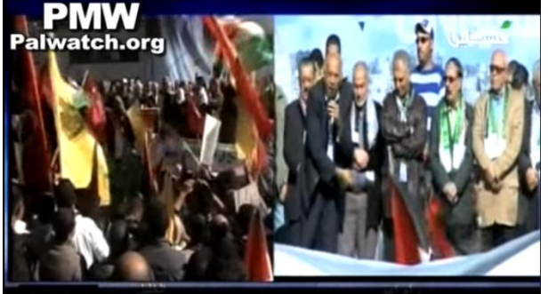
Resistance is Fatah's strategic option – in all its forms.

"Whoever invades our territory, will leave in a wooden plank (i.e., in a coffin). This land is our land... Out of loyalty to your blood, Yasser Arafat, you who died during this month, we will not return the sword to its sheath until there is a state... Resistance is Fatah's strategic right - in all its forms... We are ready - if there's shooting, we'll shoot. If there are demonstrations, we'll demonstrate."