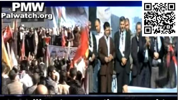
we will not return the sword to its sheath until there is a state...