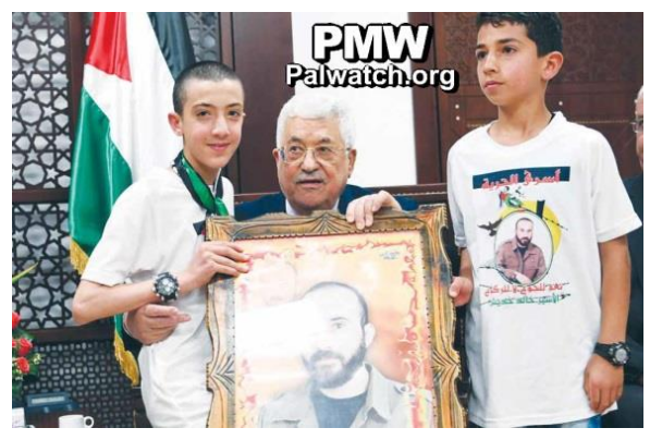
Caption: "The [PA] president embraces two children of prisoners during a meeting with their families in Ramallah, [official PA news agency] WAFA"

Abbas posed with several relatives of imprisoned terrorists and "Martyrs," among them: