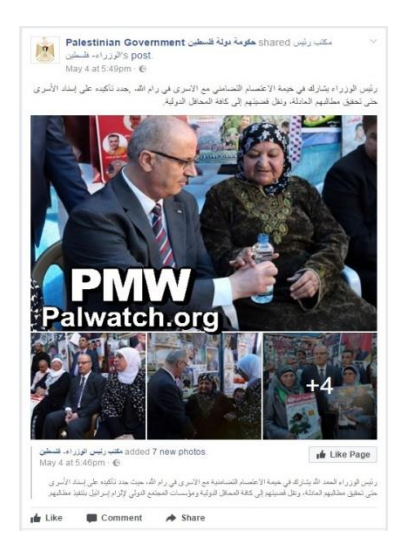
Abbas received Um Nasser Abu Hmeid, the mother of 4 terrorist prisoners serving between them 18 life sentences. [Official PA daily Al-Hayat Al-Jadida, April 29, 2017]