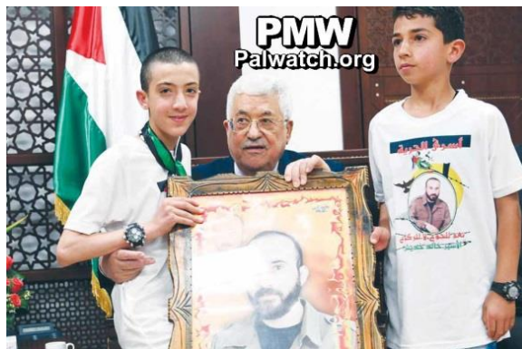
Caption: "The [PA] president embraces two children of prisoners during a meeting with their families in Ramallah, [official PA news agency] Wafa"

Abbas posed with several relatives of imprisoned terrorists and "Martyrs," among them: