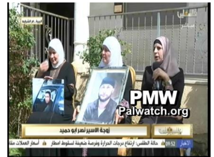
Text on screen: "Wife of prisoner Nasr Abu Hmeid"

"Director of [PLO] Commission of Prisoners and Released Prisoners' Affairs Issa Karake today... In a speech that he gave during the mass rally that passed through the streets of Ramallah and El-Bireh as a sign of solidarity with the prisoners' movement , he added that 'the world must listen to the prisoners' voices and the Palestinian people's voice - we are a people that only wants