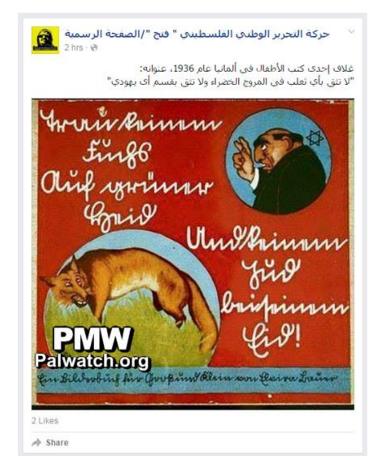
Image and text posted to official Fatah Facebook page on Oct. 29, 2015

The image shows the picture of the cover of a children's book from Germany from 1936 with the title: "Trau keinem Fuchs auf grüner Heid und keinem Jud bei seinem Eid" Fatah's Posted text is a translation of the book's title: